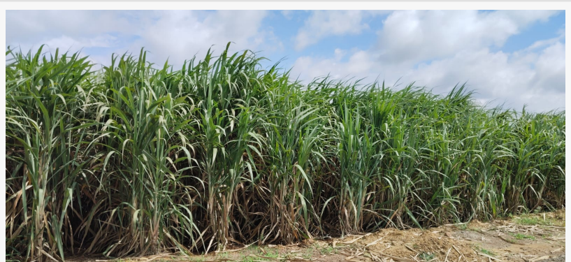
Sugarcane Farming, EID Parry

soil health, and unlock access to carbon finance, aligning with India's goals for climate resilience and agricultural sustainability.