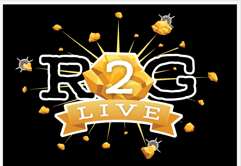
Legacy Pro Rodeo - Road to the Gold High-Stakes Series R2GLive