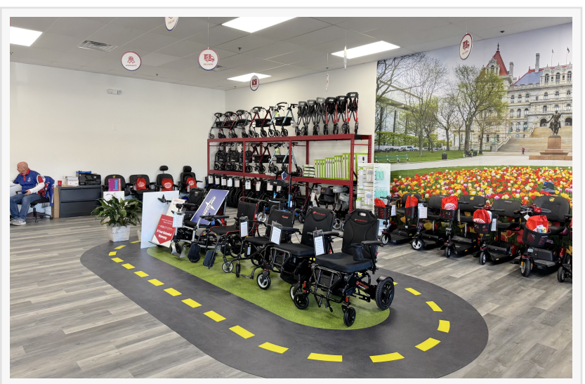
Mobility City of Albany has a variety of mobility products Inside the showroom

One hundred percent woman owned, Mobility City locations uniquely offers repair, rental and sale services for mobility products including stair lifts, hospital beds, lift out chairs, wheelchairs, power chairs, mobility scooters and ramps.