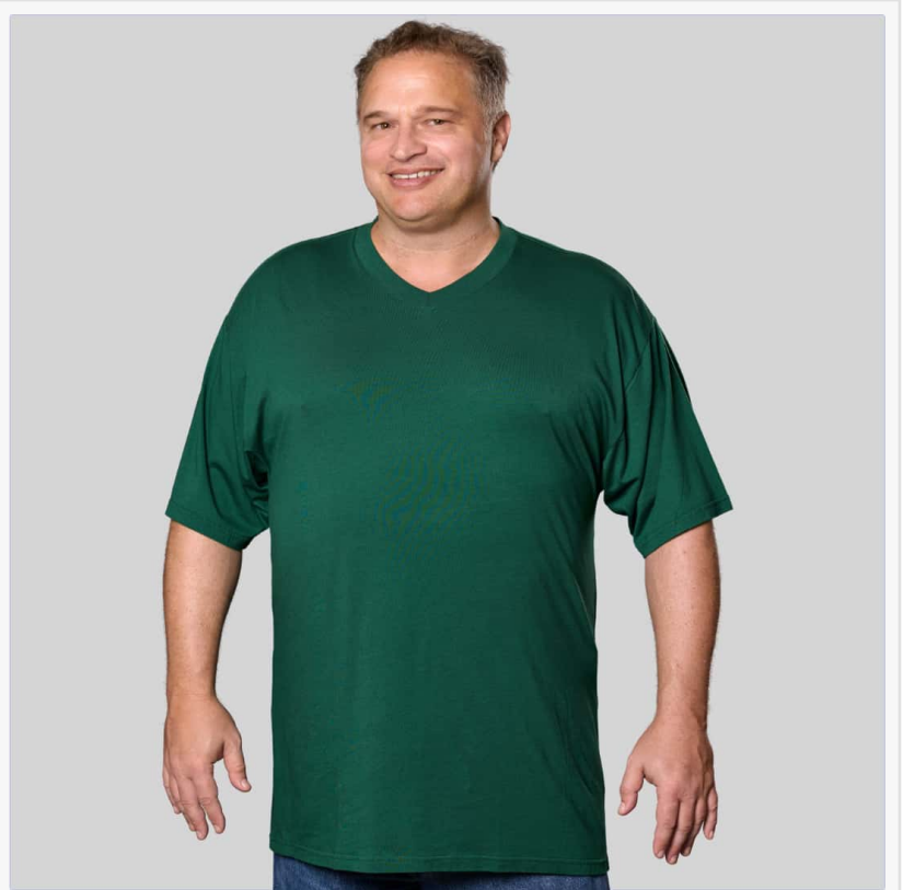
Big Boy Bamboo Pesto (Dark Green) Big & Tall T-Shirts

We are thrilled to announce we've transitioned to 100% plastic-free packaging and shipping supplies. Our new glassine bags, Kraft paper packaging, and cardboard boxes are not only recyclable but also biodegradable, ensuring that our packaging leaves as little impact on the environment as possible. And, there's no added cost to you!