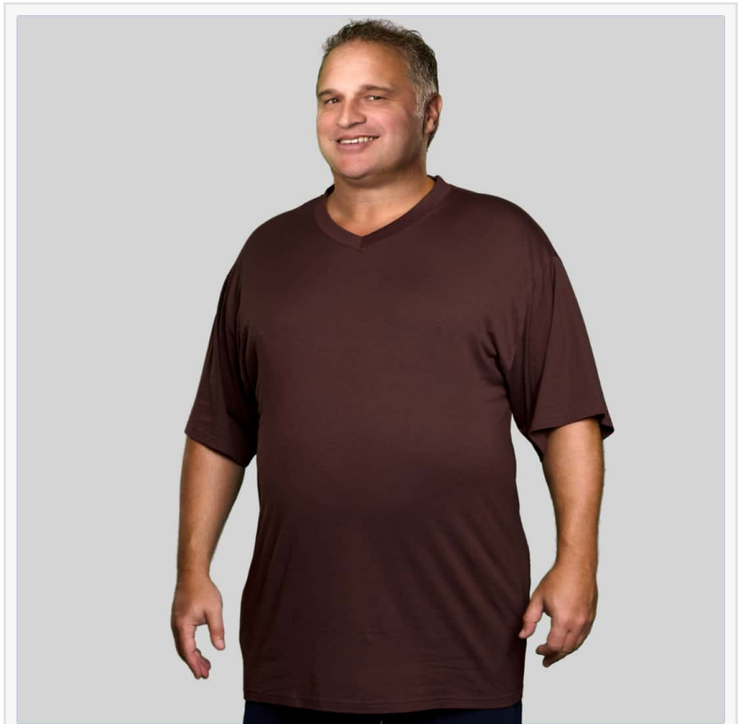
Big Boy Bamboo Chocolate (Brown) Big & Tall T-Shirts

This press release can be viewed online at: https://www.einpresswire.com/article/792928534