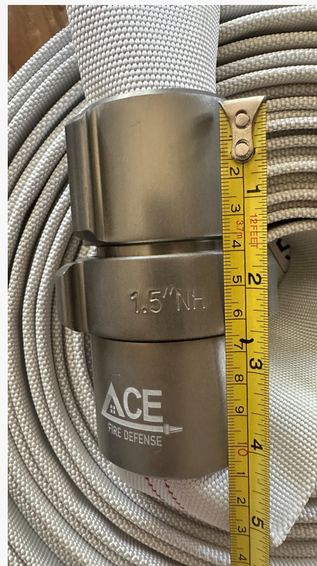
Seamless Aluminum NH NST Threaded professional couplings.