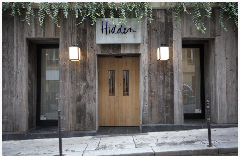
Hidden Hotel Paris