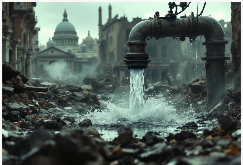
War Ruins Water