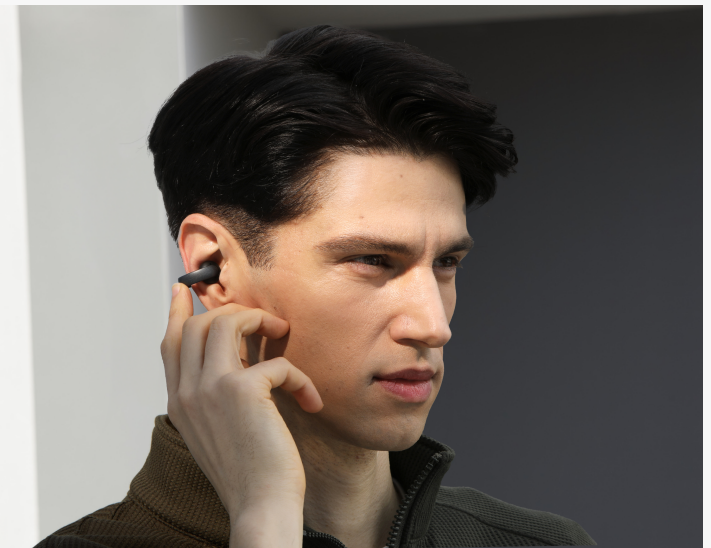
A Man Wearing Soundcore AeroClip Earbuds