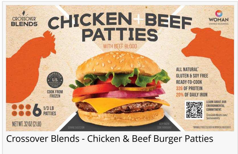
Crossover Blends - Chicken & Beef Burger Patties

1,100 Food Lion stores. From Pennsylvania to Georgia, Food Lion shoppers can now enjoy Crossover Blends™—a revolutionary mix of wholesome chicken + beef, or chicken + lamb that delivers the taste consumers crave, while being healthier and more sustainable.