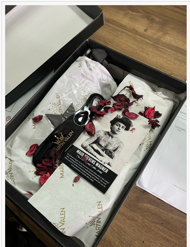
Women's Day Gift in the Shoe Box

The postcards feature images of five influential women who have shaped culture in powerful