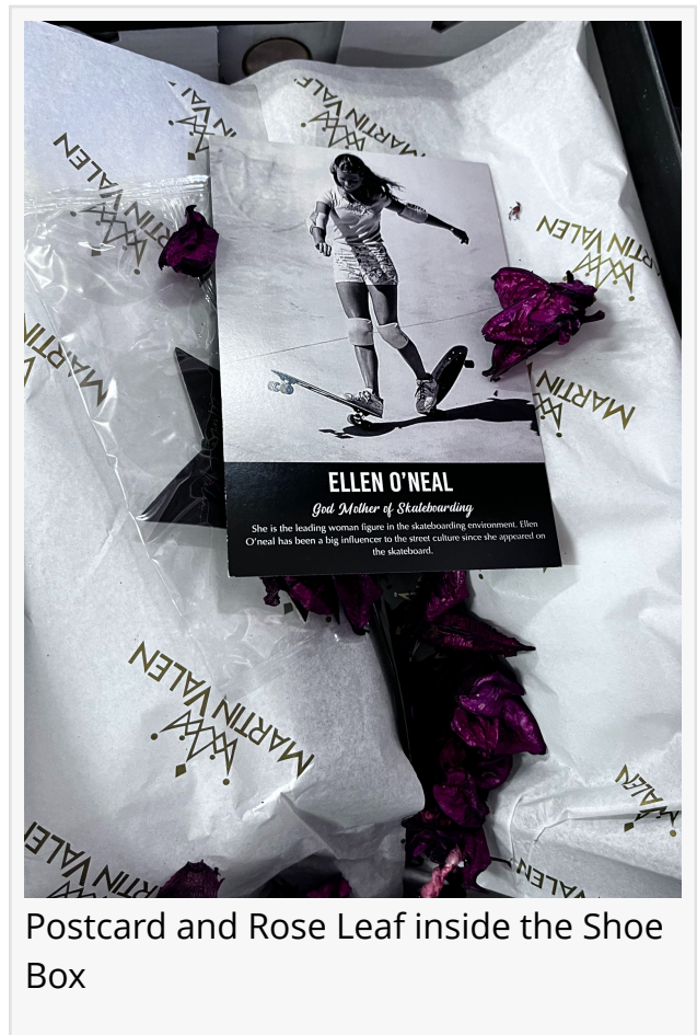
Postcard and Rose Leaf inside the Shoe Box

The postcards and rose petals will be included in all women's shoe orders placed during Women's Day week. Martin Valen invites its customers to join the celebration and reflect on the power and influence of women throughout the world.