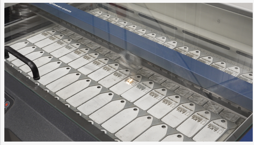
Laser engraving the new Aviationtag x Iron Maiden Ed Force One Edition

Mood photo of Aviationtag x Iron Maiden Ed Force One Tag