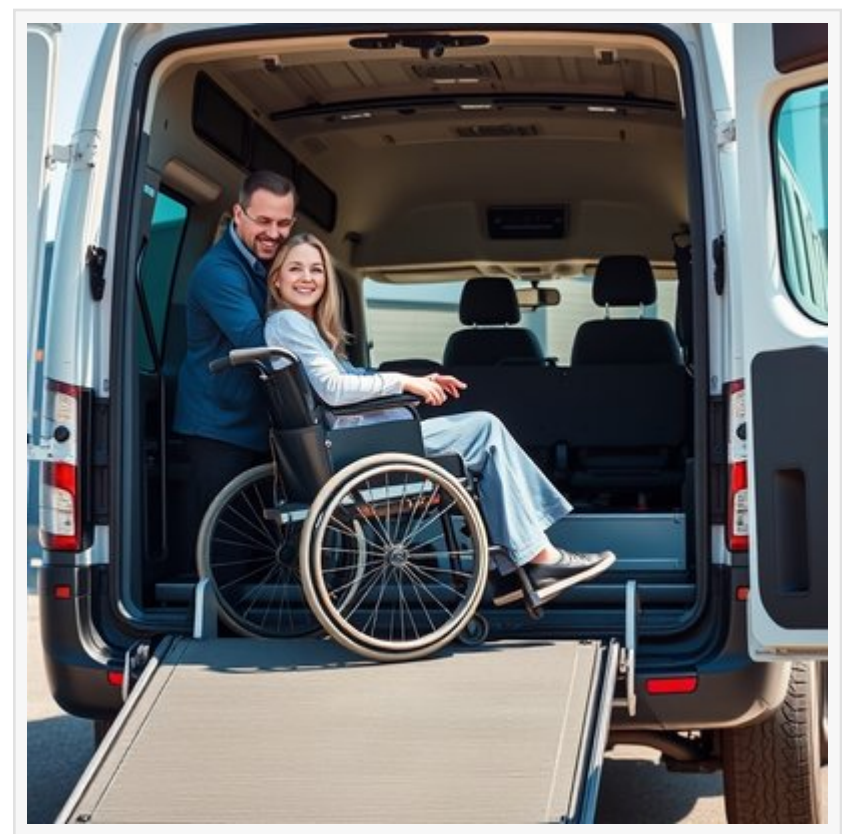
Beyond Ride Wheel Chair

Comprehensive Service Coverage: Beyond Ride will provide transportation for a wide range of needs, from medical appointments and therapy sessions to social outings and recreational activities, thereby enriching the daily lives of residents.