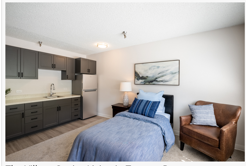
The Village Senior Living in Tacoma Rooms

Beyond Ride is dedicated to providing safe, reliable, and affordable non-emergency medical transportation services. With a focus on the elderly and disabled communities, Beyond Ride offers personalized transportation solutions that prioritize comfort and punctuality. Their services are designed to empower individuals by ensuring they have access to essential medical services and social engagements.