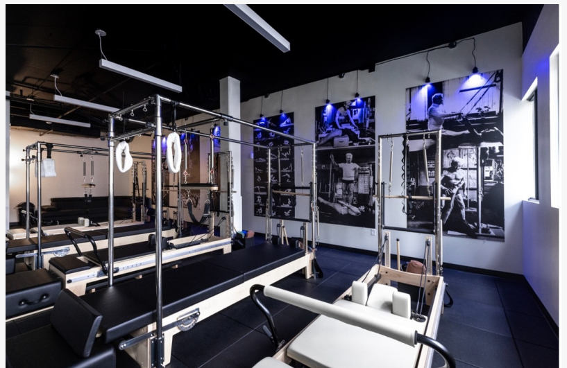
Sunset Pilates Studio