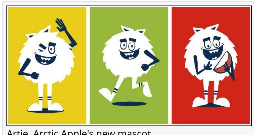
Artie, Arctic Apple's new mascot

MOSES LAKE, WA, UNITED STATES, March 12, 2025 /EINPresswire.com/ --Okanagan Specialty Fruits® (OSF) is making snack time more exciting than ever with a vibrant redesign of its Arctic® apple 2 oz. packaging, now featuring bold, playful colors and its