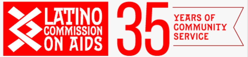
Latino Commission on AIDS 35th Anniversary Logo

AIDS and will raise vital funds to support ongoing advocacy efforts, which were at the heart of its founding and are needed now more than ever. The event will also highlight its partnership with the Hispanic Health Network to lead prevention efforts and community initiatives that will center on access to care for the Latino population.