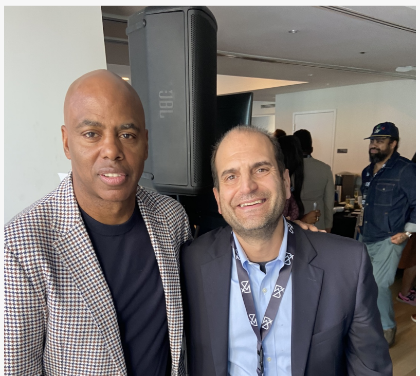
TravelingWiki Foundation Discussing its Non Profit Work with the Co-Host of Entertainment Tonight, Kevin Frazier