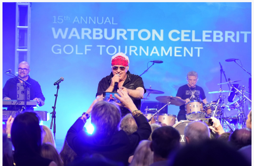
Mike Reno, lead singer of Loverboy at The RheneyPalooza Jam