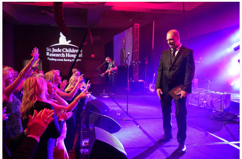
Tournament host, actor Patrick Warburton