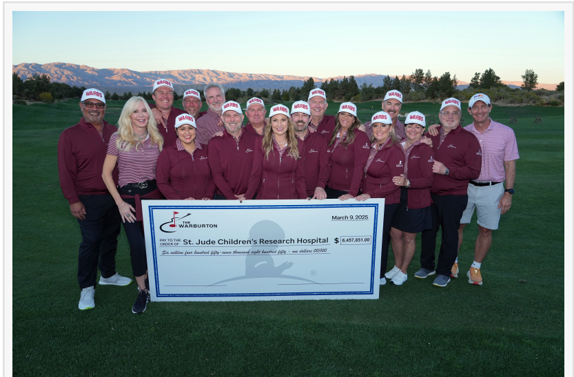
Board members of The Warburton present a check for more than $6.4 million to St. Jude

PALM DESERT, CA, UNITED STATES, March 12, 2025 /EINPresswire.com/ -- The Patrick Warburton Celebrity Golf Tournament (known as The Warburton ), returned to the desert for its 15th year March 6-9, 2025, smashing new records for funds raised by the event – with more than $6.4 million raised over the weekend, bringing the total raised by this top-grossing golf tournament fundraiser for St. Jude Children's Research Hospital® to over $38 million.