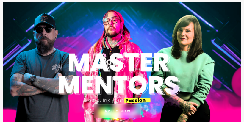
Master Tattoo Artist Mentors - Ink Different Tattoos

HOLLYWOOD, FL, UNITED STATES, March 12, 2025 /EINPresswire.com/ -- Ink Different is proud to announce the official launch of its “Master Mentors Program” — a groundbreaking evolution of its national tattoo apprenticeship program. The Master Mentor Program connects would-be tattoo apprentices with Ink Masters, celebrity Tattoo Artists, and some of the industry's most significant and accomplished professionals, offering unprecedented access to real-world career training to become a Tattoo Artist .