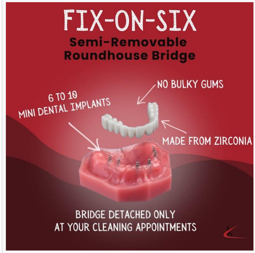
Snap-On Dentures in Winston-Salem, NC - All-on-4 Alternatives