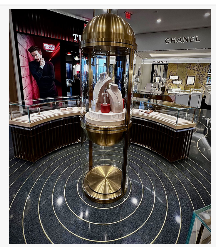
THE FLOOR'S design includes flowing brass inlays, aligning with the store's branding and enhancing the store's updated aesthetic.