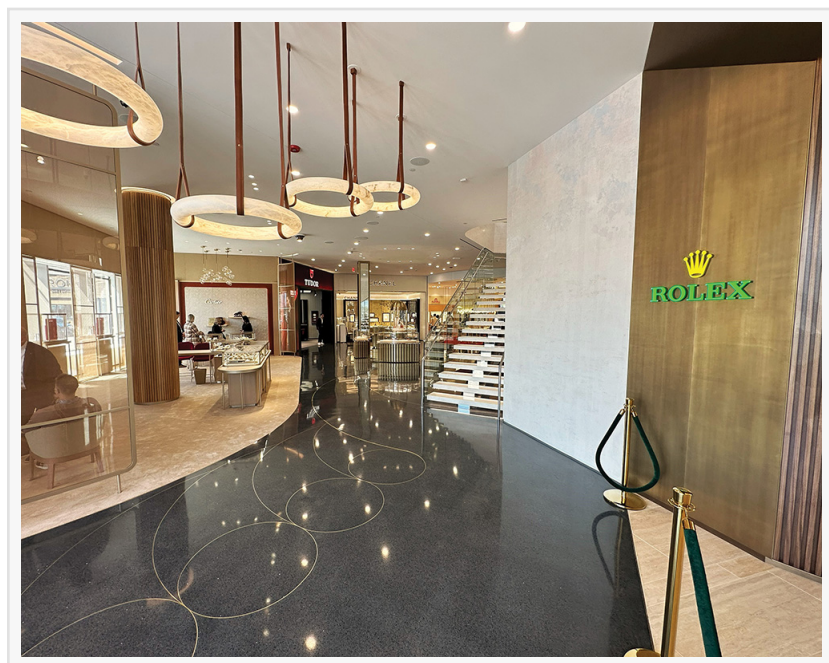
BLACK EPOXY terrazzo with brass stripwork recalls C.D. Peacock's historic logo.

This press release can be viewed online at: https://www.einpresswire.com/article/793244404