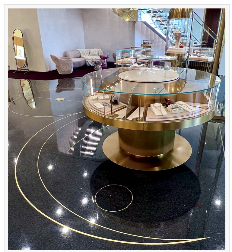
AWARD-WINNING TERRAZZO in C.D. Peacock's Oakbrook, Ill., location contributed to a branded space that honors the boutique's history.

NTMA is a full-service nonprofit trade association headquartered in Fredericksburg, Texas. Founded in 1923, the association establishes national standards for terrazzo flooring and promotes terrazzo as a sustainable, durable, and versatile flooring material. The NTMA provides complimentary services to architects, interior designers, artists, general contractors, maintenance professionals, and property owners. From helping the design community write specifications to providing