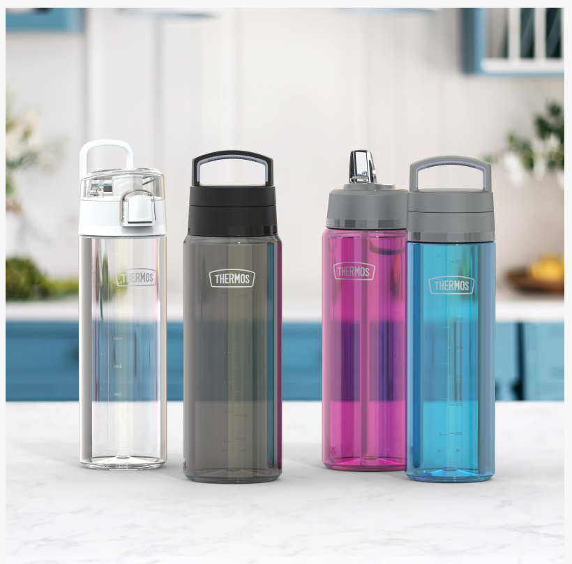
Thermos Brand new Icon™ Series Lightweight Water Bottles in Clear, Smoke, Aubergine and Teal.