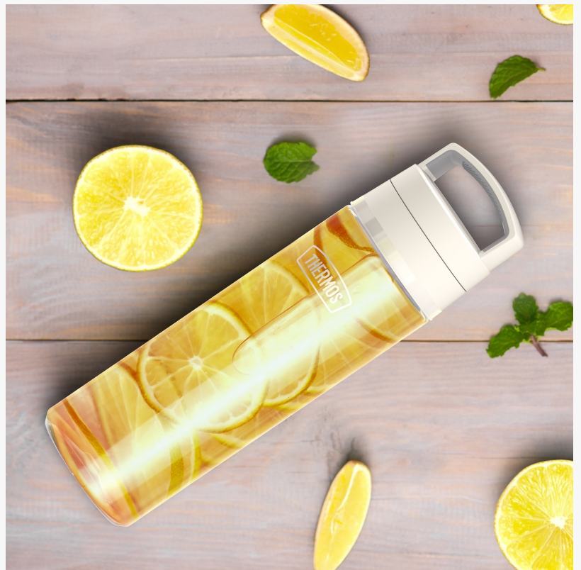
Thermos Brand new Icon™ Lightweight Water Bottle in Clear filled with infused lemon water.