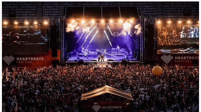
Thousands attending the Heartbeats International Festival in Romania