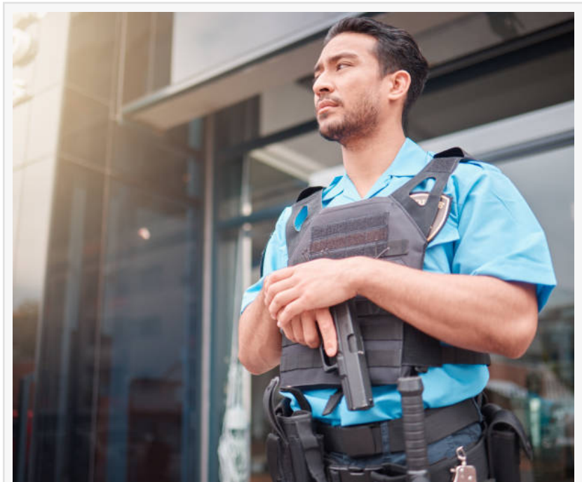
business complex security guards

By refining its services, adopting innovative security practices, and expanding its workforce of highly trained security professionals, Allied Nationwide Security continues to raise the bar in the industry. As security threats evolve, the company remains proactive, ensuring its clients receive the most effective protection against theft, vandalism, and unauthorized access. A key aspect of this commitment is the continuous improvement of security protocols. Allied Nationwide Security regularly assesses emerging risks and updates its strategies to address them. From advanced surveillance technology to enhanced training programs for its guards, the company takes a comprehensive approach to security. Each officer undergoes rigorous screening, background checks, and specialized training in risk assessment, conflict resolution, and emergency response. This ensures they are prepared to handle real-world security challenges with professionalism and efficiency. Beyond training, Allied Nationwide Security leverages modern security technology to enhance its services. Surveillance cameras, mobile patrol tracking systems, and access control solutions help streamline operations and improve response times. These innovations allow security personnel to detect and prevent threats more effectively, providing an added layer of protection for clients.