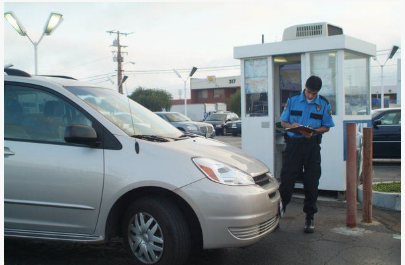
Auto dealership security services