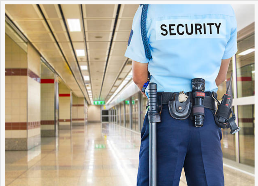
commercial shopping security

LOS ANGELES, CA, UNITED STATES, March 21, 2025 /EINPresswire.com/ -- Allied Nationwide Security, a trusted name in the security services industry, has unveiled a series of new initiatives designed to strengthen safety measures and set higher standards for protection. With security threats constantly evolving, the company remains committed to proactive risk management and continuous improvement. These initiatives focus on enhancing security strategies, training personnel, and implementing advanced surveillance technologies to provide comprehensive protection for businesses and commercial properties. Recognizing the unique security challenges faced by different industries, Allied Nationwide Security has tailored its approach to address the specific needs of automotive dealerships, business complexes, and commercial shopping centers. Auto dealerships require robust security to protect high-value vehicles from theft and vandalism, while business complexes demand vigilant monitoring to ensure the safety of employees and visitors. Similarly, commercial shopping centers need effective security measures to prevent shoplifting, disturbances, and unauthorized access.