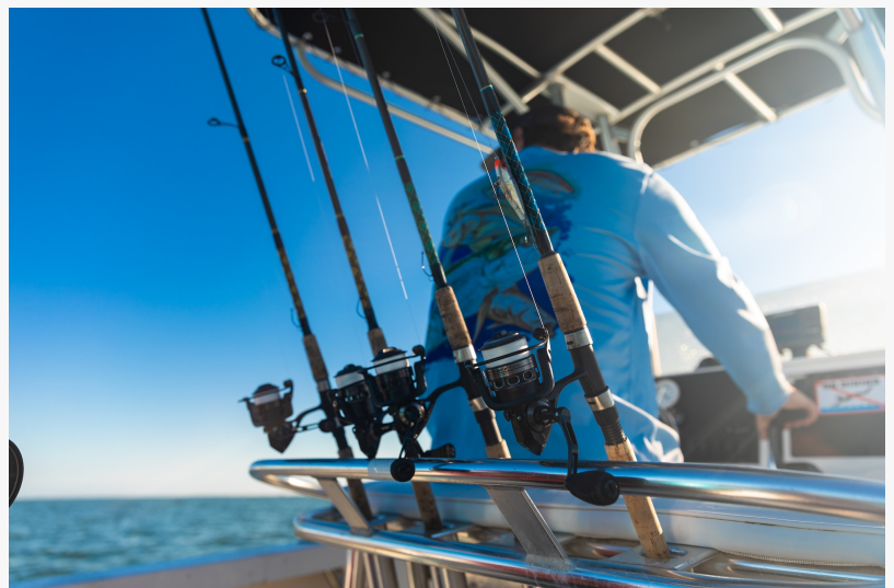
South Seas Going out Fishing