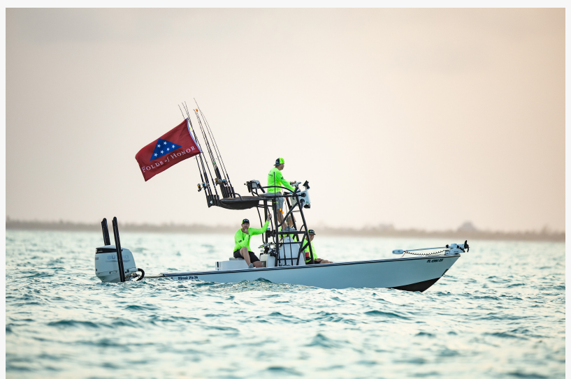
South Seas Tarpon Tournament