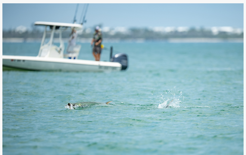
Captiva's South Seas Tarpon Tournament

Families enjoy sun-soaked beaches, island adventures and family-friendly activities over