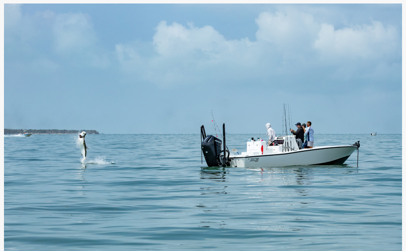
Captiva's South Seas Tarpon Tournament