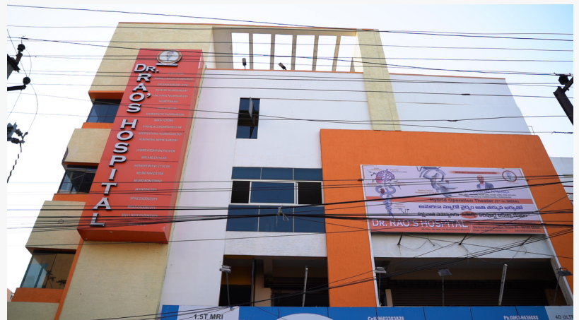
Dr Rao's Hospital - the best neurology hospital in Guntur