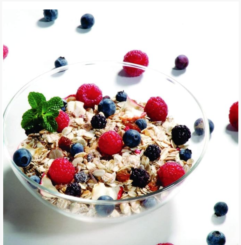
Venosta by Fuchs : Muesli with wild fruit a true gourmet crunchy delight in Dubai - UAE | IFM Investments LLC