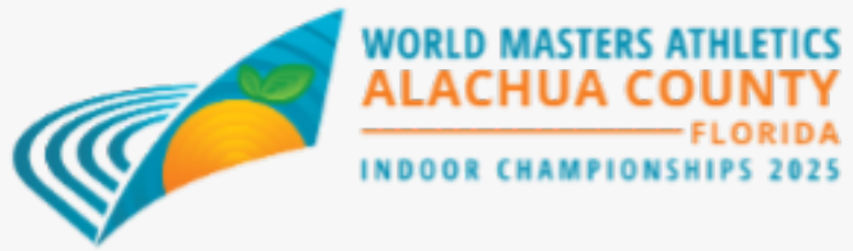
World Masters Athletics Indoor Championships 2025 Logo

The Alachua County Local Organizing Committee (LOC) is dedicated to delivering an