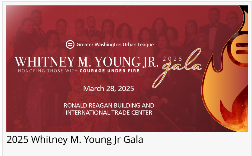
2025 Whitney M. Young Jr Gala

The Gala takes place on Friday, March 28, 2025, at 6.00 PM EST at the Ronald Reagan Building and International Trade Center.