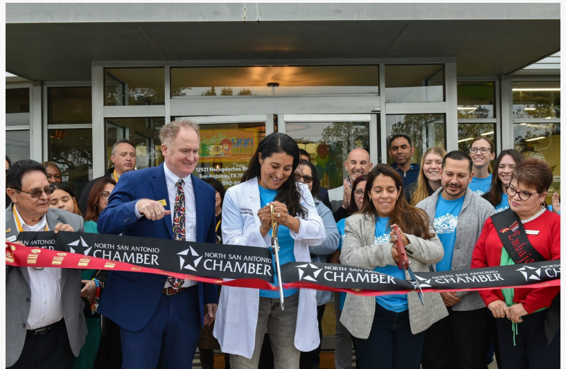
Ribbon- Cutting Ceremony