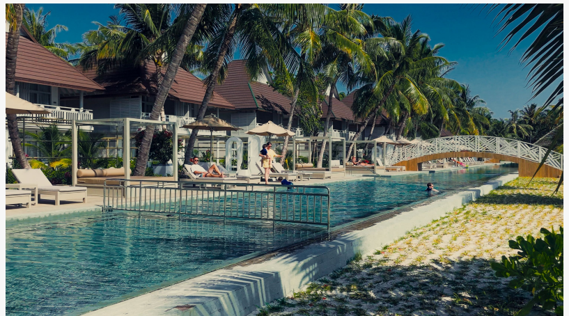
Maldives' Longest Pool at Sun Siyam Olhuveli

The interior design, reimagined by London-based Studio Sixty7 over a six-month period, featured a seamless open-plan concept that emphasized a connection to the outdoors and uninterrupted