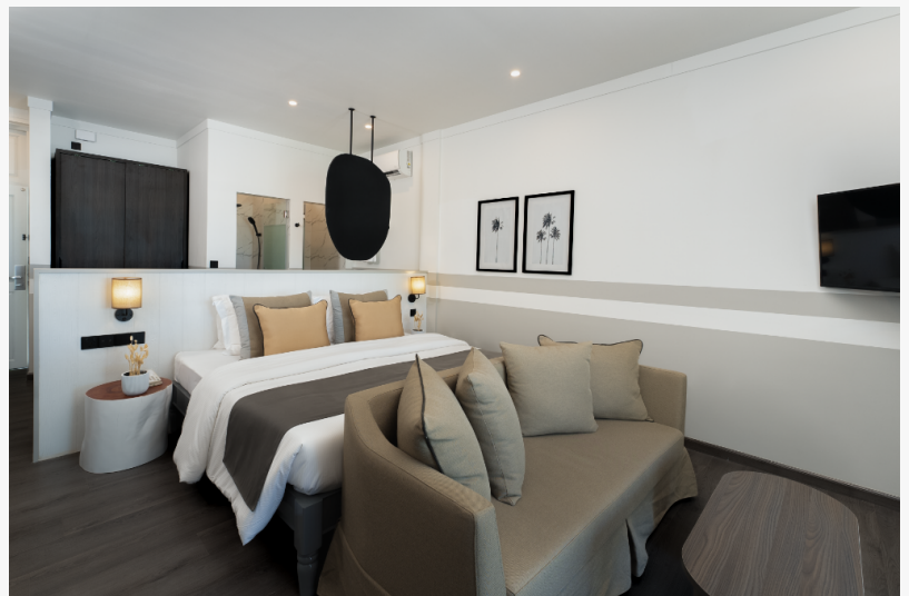
Renovated Beach Pavilions at Sun Siyam Olhuveli