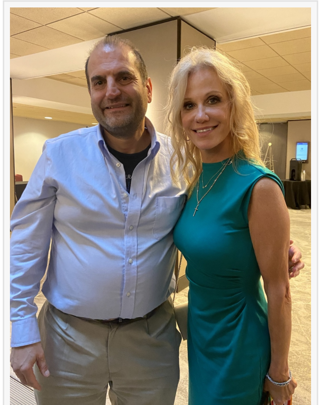
TravelingWiki Supports Special Needs Resources With Events at Both Major Party Conventions & Engaged Jen Psaki & Kellyanne Conway as well as Other Advisors at the Three Most Recent White House Admin.