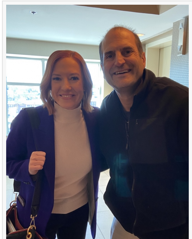
TravelingWiki Has Engaged Leaders from Sectors Across the Economy on Non Profit Work to Support Non Visible Disabilities. Here TravelingWiki's CEO Engages Former White House Press Secr. Jen Psaki.