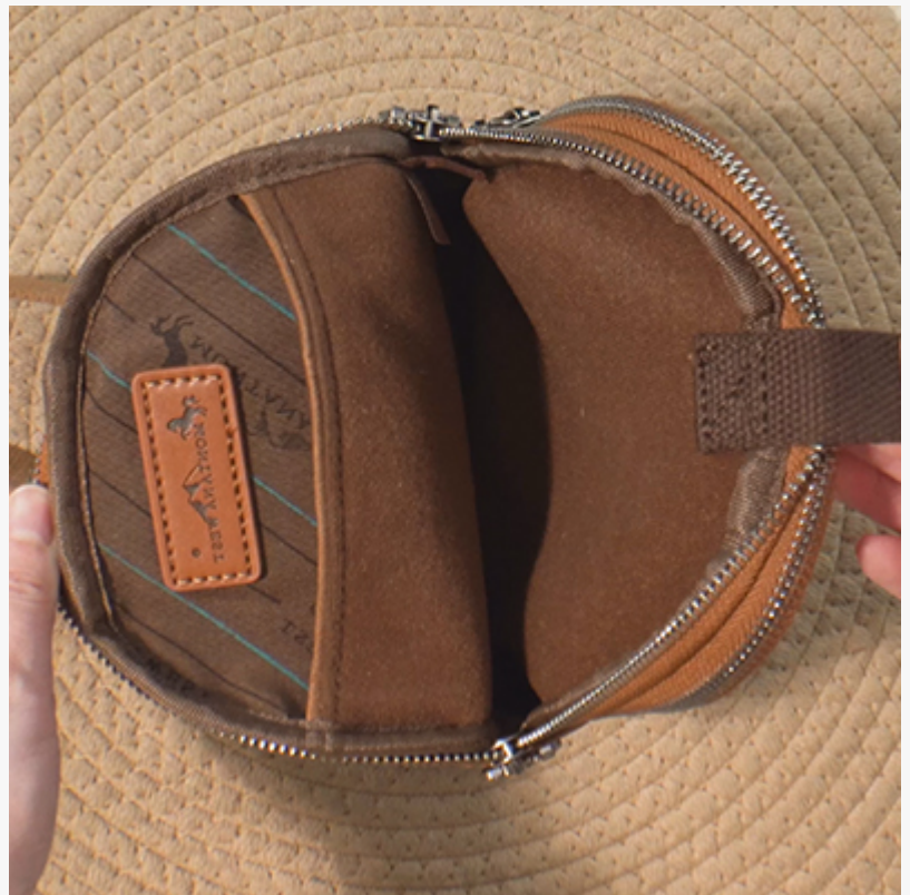
Montana West Concealed Carry Sling Bag Lining