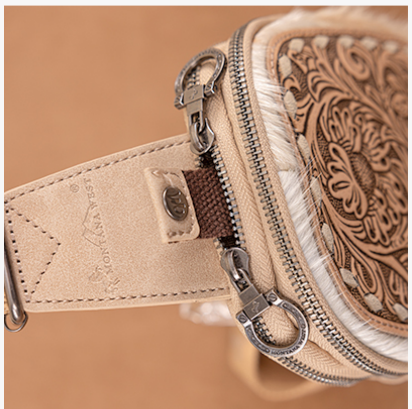
Montana West Concealed Carry Sling Bag Overall

Real-Time Shipping Updates: Customers can instantly track their orders with accurate, up-to-date information.