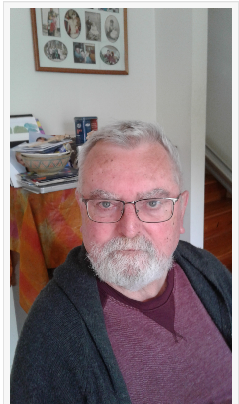
The Author Robert Phillips

This press release can be viewed online at: https://www.einpresswire.com/article/793847085