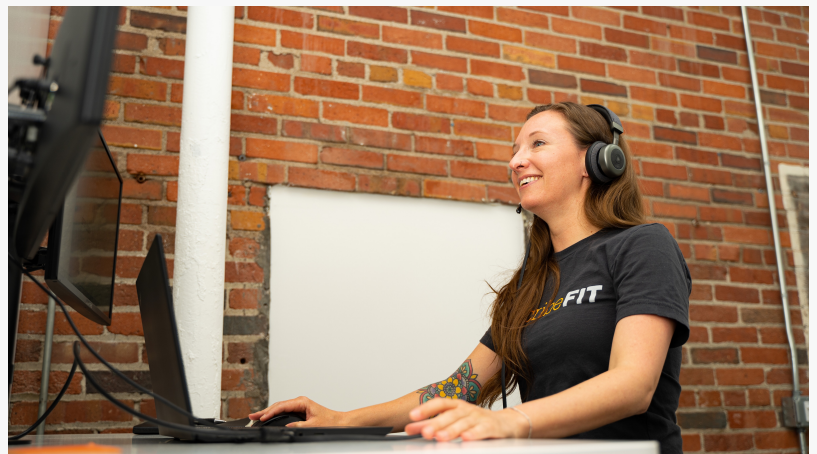
At-Home Health Coaching and Personalized Orthopedic Wellness Program

70% of participating patients have already reduced their pain and 65% have increased mobility.