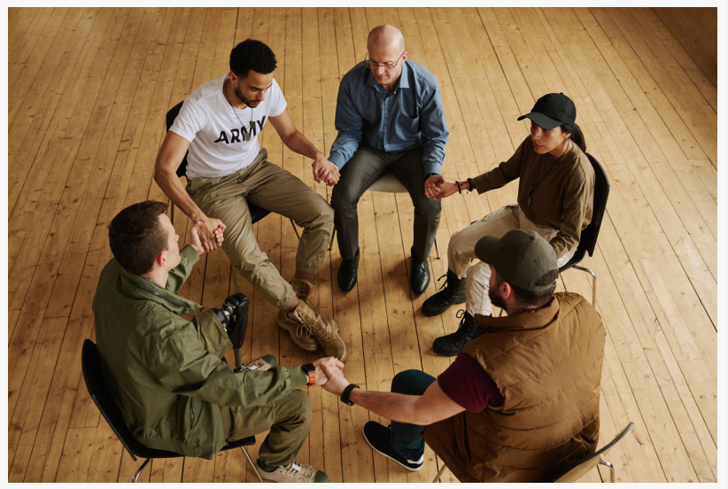
Al-Driven Recovery Support