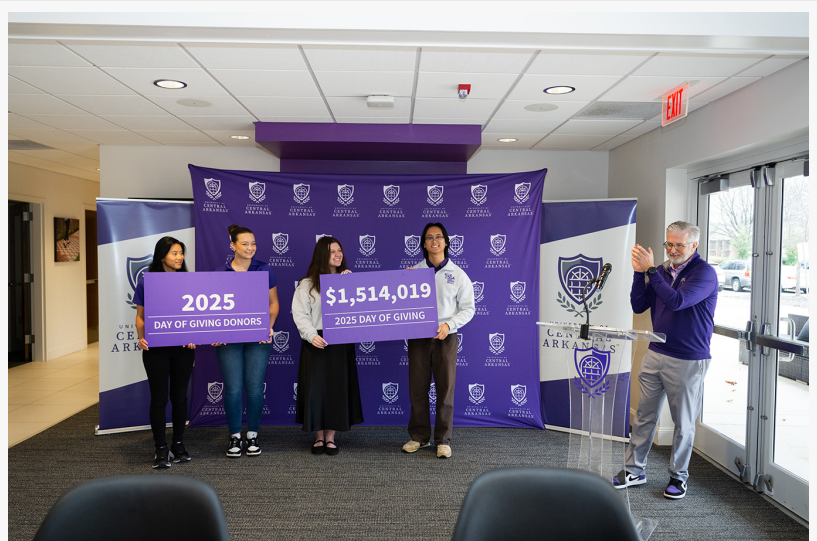
UCA President Houston Davis celebrates 2025 Day of Giving totals while students hold results cards at announcement ceremony.

The total was announced today during a campus celebration at Buffalo Alumni Hall. Marking the fourth time the university raised more than $1 million, the amount also marks another record-breaking total for the university's Day of Giving with a 2% increase over last year's record of $1.47 million.