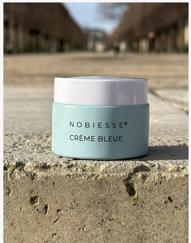
Nobiesse Crème Bleue with Methylene Blue Anti Oxidant