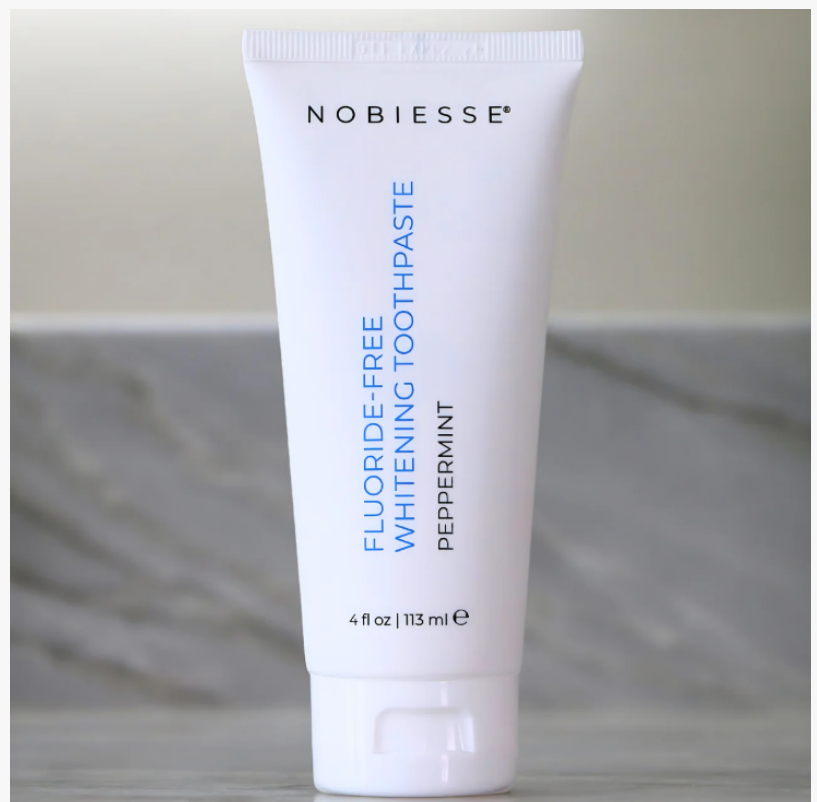
fluoride-free whitening toothpaste