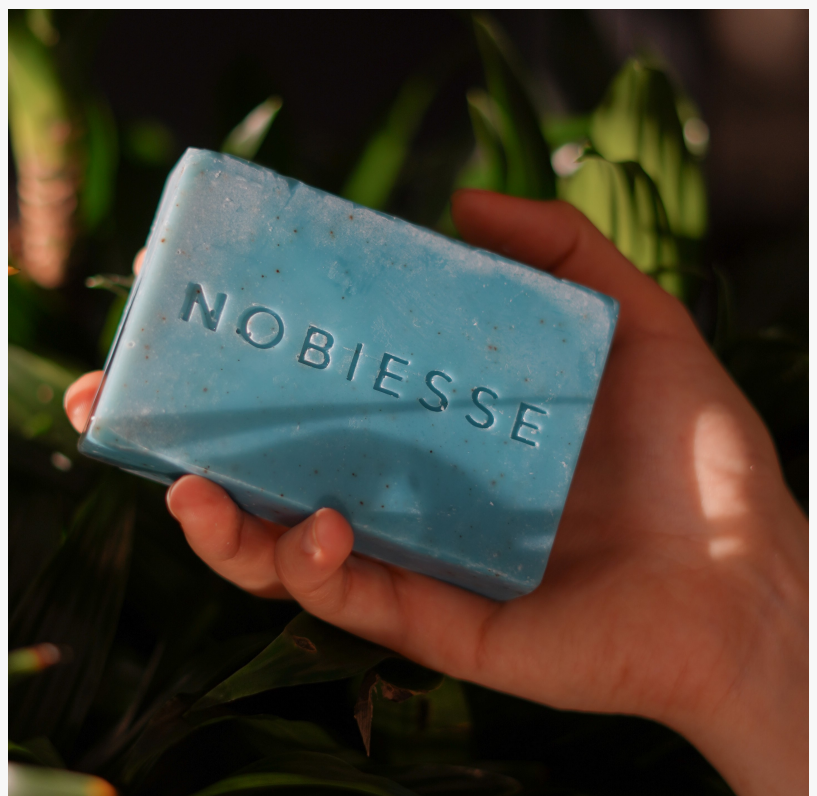
Nobiesse Methylene Blue Bar Soap Exclusive Anti-Oxidant Bath Shower

Reduces Inflammation: Unlike traditional exfoliants or retinoids that can cause redness and