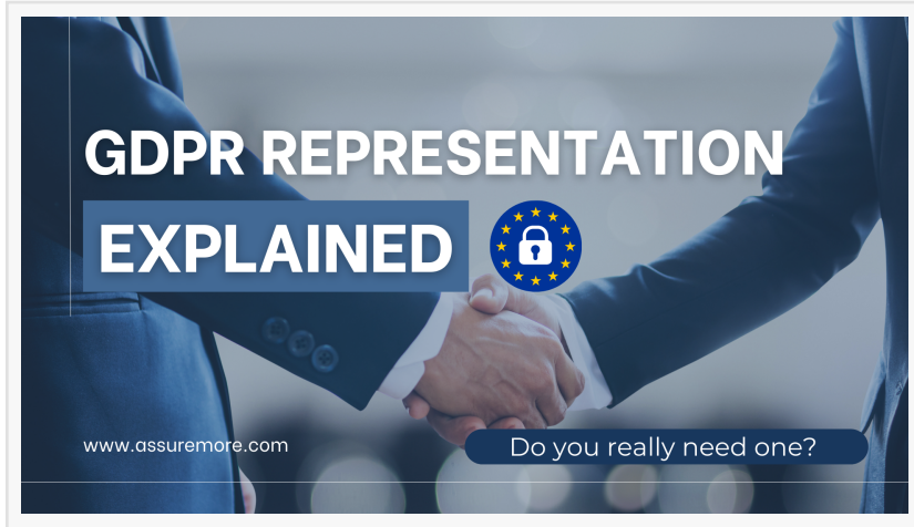
Asuremore GDPR Representative Service

A qualified GDPR representative serves as a bridge between companies and the European data protection