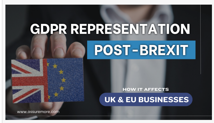
Asuremore GDPR Representative Service

landscape, offering insights that go beyond basic regulatory requirements. This is particularly important following the invalidation of the EU-US Privacy Shield, as representatives provide a stable point of contact for data protection authorities and data subjects, ensuring continuity in data protection practices.