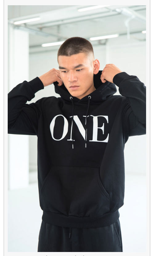
ONE Male Model Wearing ONE Hoodie (Series I)