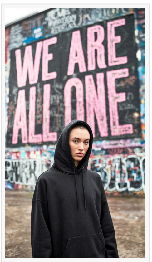
ONE BRAND Model In Front Of Beautiful Graffiti Wall Stating "We Are All One"