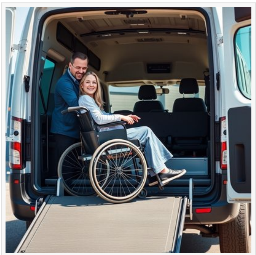
Beyond Ride Wheel Chair

A Model for Future Initiatives This innovative approach sets a precedent for other assisted living facilities in Tacoma and beyond. By focusing on education and empowerment, the "Mobility Mentorship" program challenges traditional models of care and offers a replicable framework for enhancing resident autonomy.