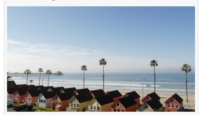
walnut creek homes

and privacy, integrating practical storage solutions and carefully selected finishes. Bathrooms are designed with an emphasis on efficiency and comfort, featuring high-end fixtures and durable materials.