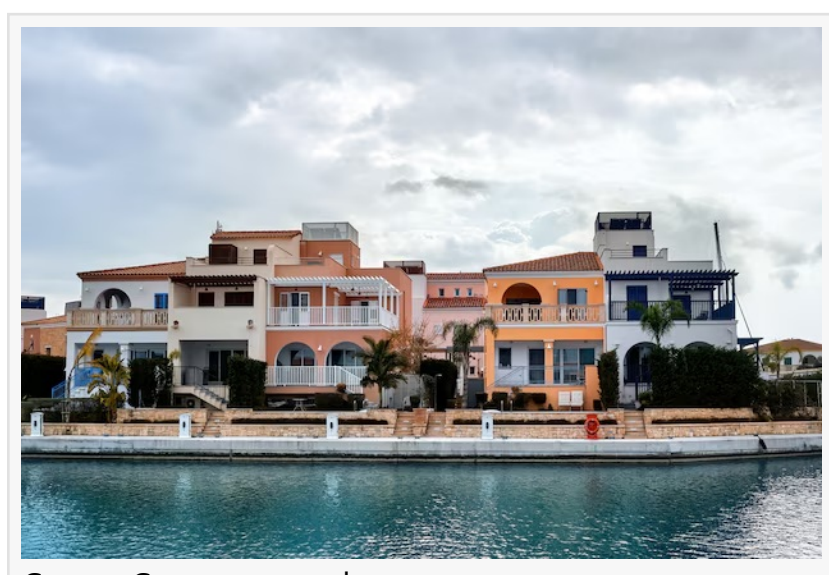
Contra Costa county- houses