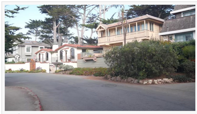
Real estate agent services