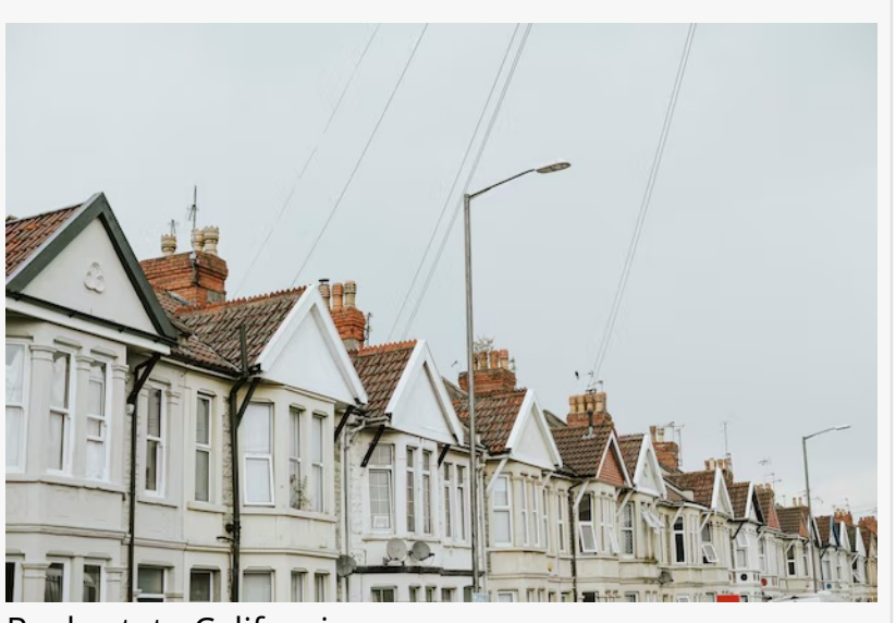
Real estate California