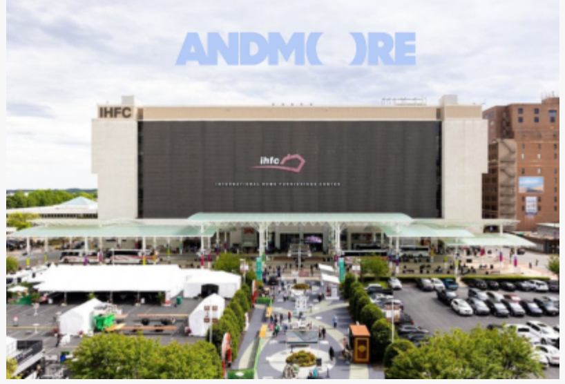
WithIt's event sponsor ANDMORE will host the 2025 WOW Awards in their IHFC Ballroom during High Point Market.

Fashion Snoops is honored to be part of this year's décor committee, bringing the 'La Vie en Rose' experience to life.