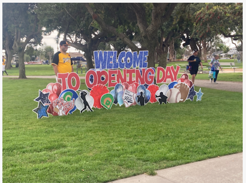
Opening day for The Los Angeles Trial Lawyers Charities ninth-annual Buddy Ball in Long Beach

For more information about LATLC and its commitment to the community, visit www.latlc.org .