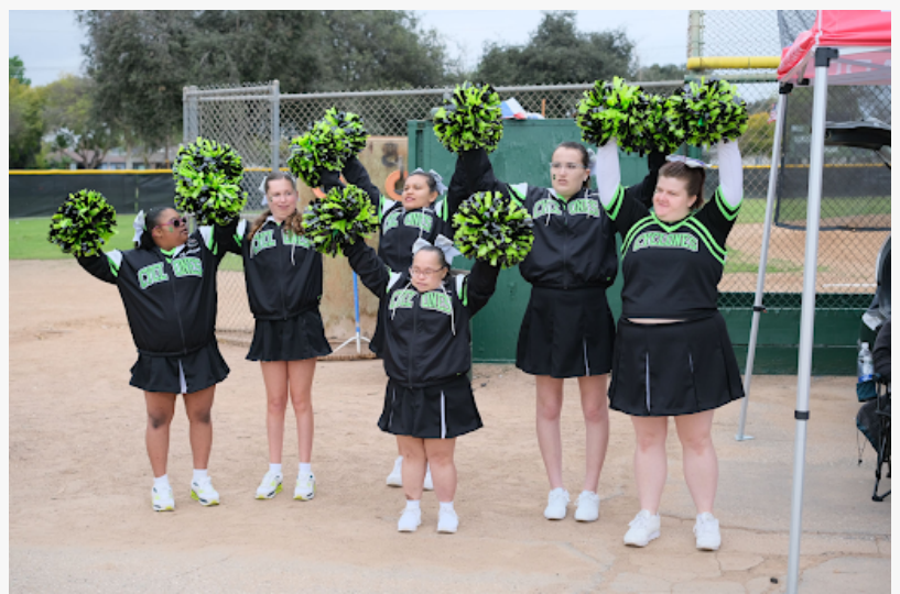
The Cyclone cheerleading squad at The Los Angeles Trial Lawyers Charities ninth-annual Buddy Ball in Long Beach