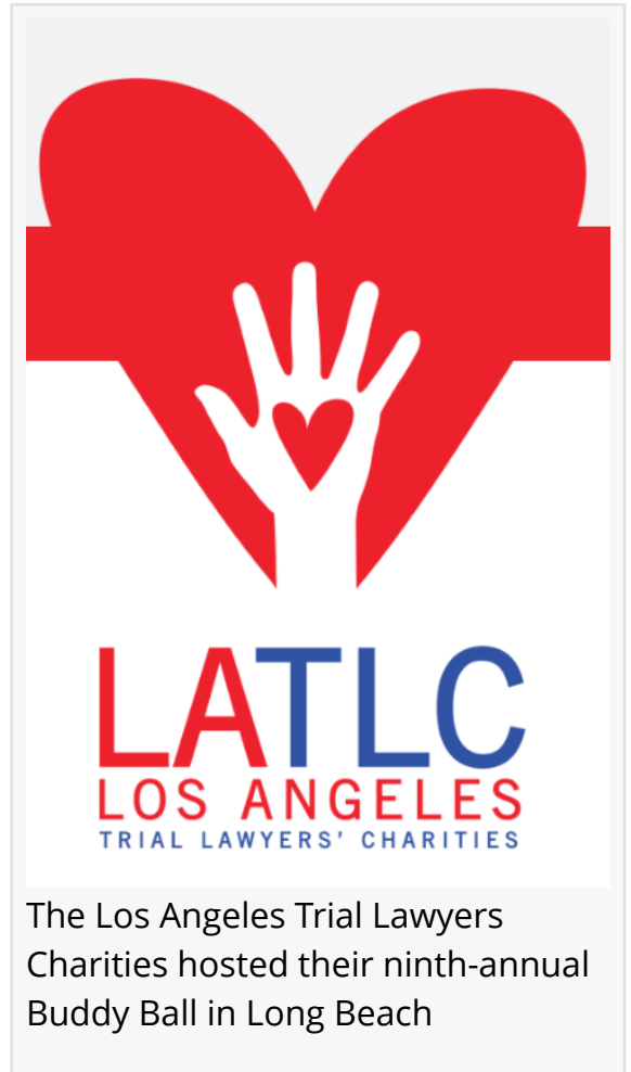
The Los Angeles Trial Lawyers Charities hosted their ninth-annual Buddy Ball in Long Beach