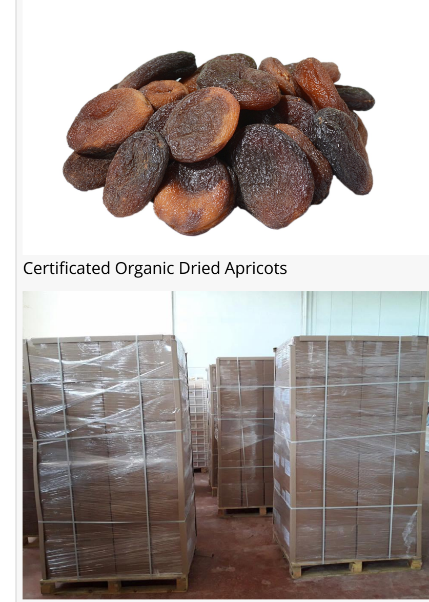
Dried Apricots Shipment Process

Rising Demand in the Functional Food Industry: Dried apricots are being