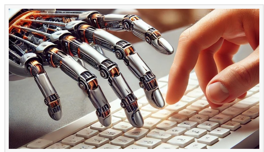
Al vs Human Transcription

The findings are striking: Ditto's human transcriptionists deliver an impressive 99% accuracy rate, while <u>Al-driven</u> transcription tools average just 61.92%.