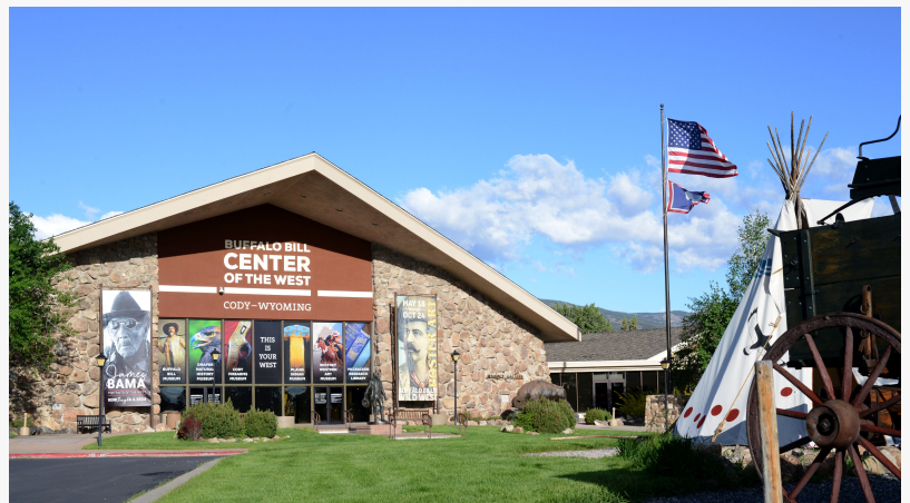
The Buffalo Bill Center of the West located in Cody, Wyoming