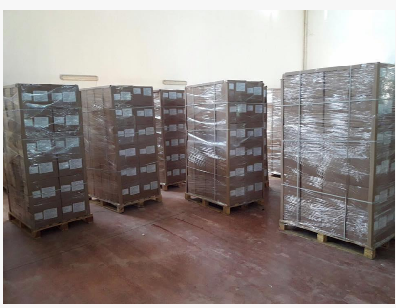
Wholesale Dried Apricot Supplier and Exporter

climatic conditions, rich agricultural heritage, and commitment to high-quality production have solidified its reputation as a premier supplier in the industry.