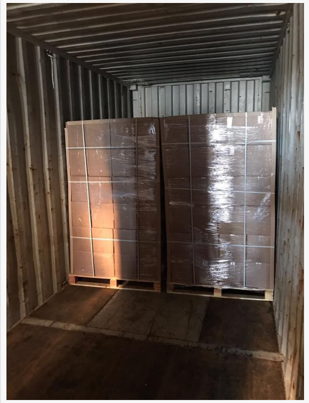
Dried Apricots Pallets Shipment

As a leading wholesale dried apricots supplier and exporter, Malatya Apricot | Wholesale Dried Apricots Supplier and Exporter is dedicated to meeting the growing demand for high-quality dried apricots in the global market. The expansion of operations is a testament to the company's commitment to providing its customers with the best products and services