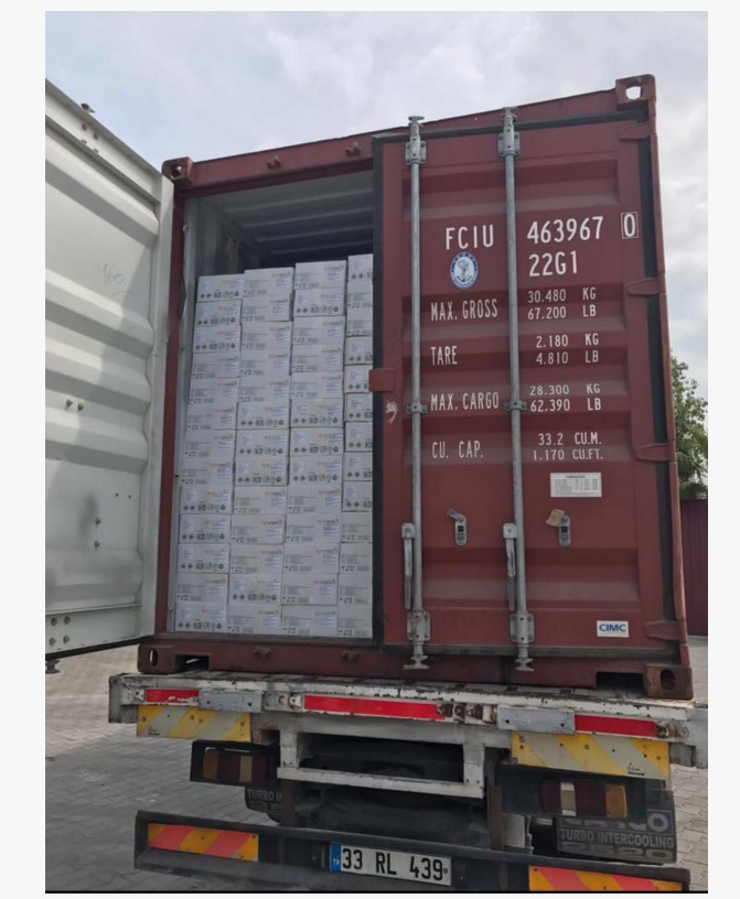
Dried Apricots Shipments

Turkey remains the leading producer and exporter of dried apricots, supplying a significant portion of the global market. The country's favorable