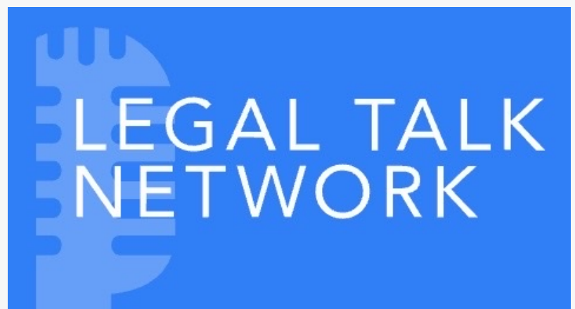
Legal Talk Network