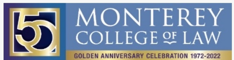
MCL 50th Logo