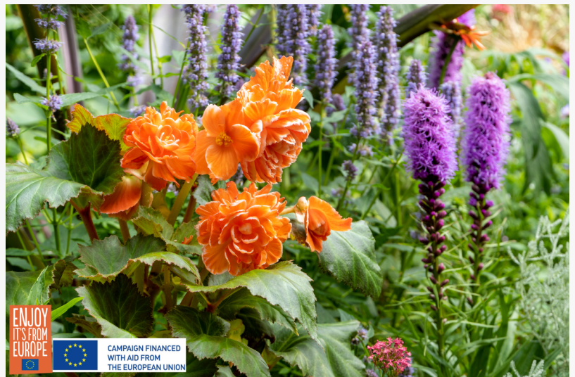
Deer Resistant Bulbs