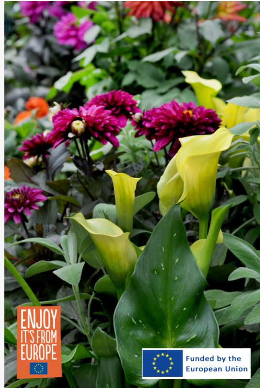
Deer Resistant Bulbs