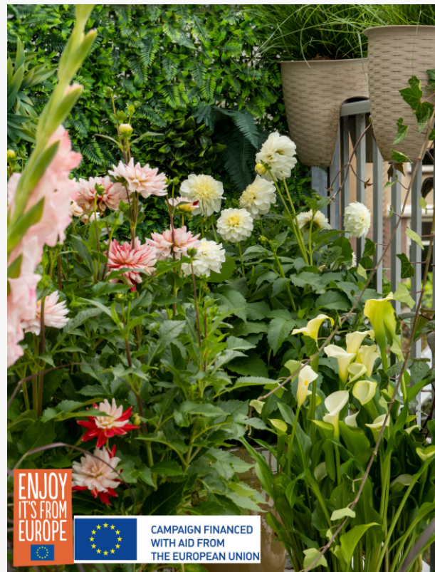
Deer Resistant Bulbs