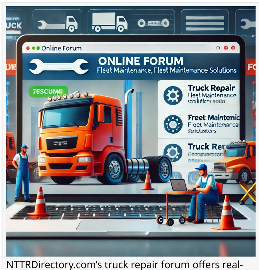
NTTRDirectory.com's truck repair forum offers realtime discussions on truck repair, fleet maintenance, and industry trends.

With this new truck repair forum, NTTRDirectory.com is expanding beyond its role as a trusted truck repair